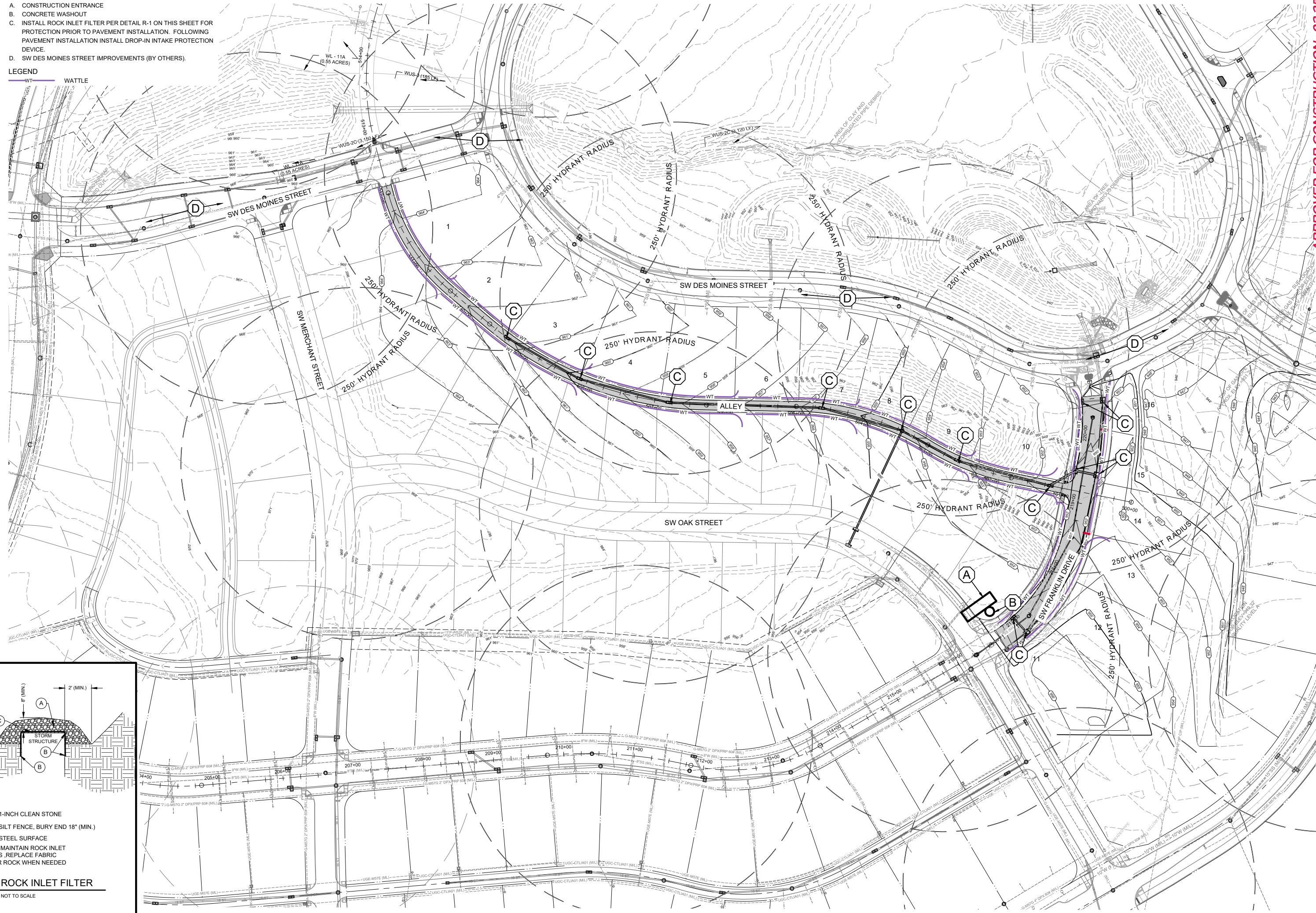
R-1 ROCK INLET FILTER NOT TO SCALE